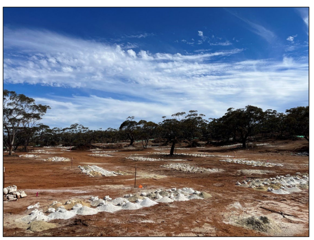
Figure 1 - Drilling at Faraday (white sample piles represent the pegmatite host)

The region is well endowed with lithium occurrences and includes three major resources at Dome North (Essential Metals Limited (ASX:ESS) to the south, Bald Hill (Lithco) to the east and Mt Marion (Mineral Resources Limited (ASX: MIN))/Gangfeng JV) to the north ( Figure 2 ).